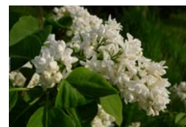
One of our new lilacs is blooming! (4-30-07)

Madison Meadow is the name of the non-profit, 501(c)(3), corporation that was formed in November of 2003 to preserve the two-acre historic, remnant orchard and meadow at 22nd and Madison in Eugene, OR. Madison Meadow is also the name of this two-acre parcel. We are currently in the process of raising funds to purchase the meadow so that we may preserve the beauty and tranquility of the meadow for decades to come. Please call 683-3430, if you wish to make a donation.